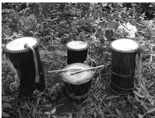
Cameroon kalangou drums