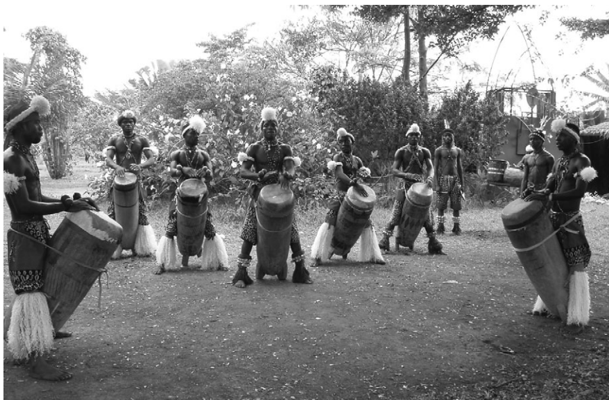
Congo ngoma ntela drums