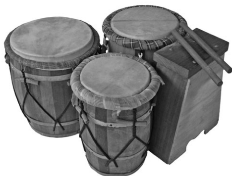
French Guiana Creole kasékò drums