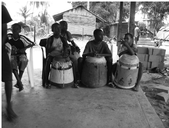
Bushinenge aluku traditional drums

From Sub-Saharan Africa to Americas, the drum as a “cultural being” for a “musical word”