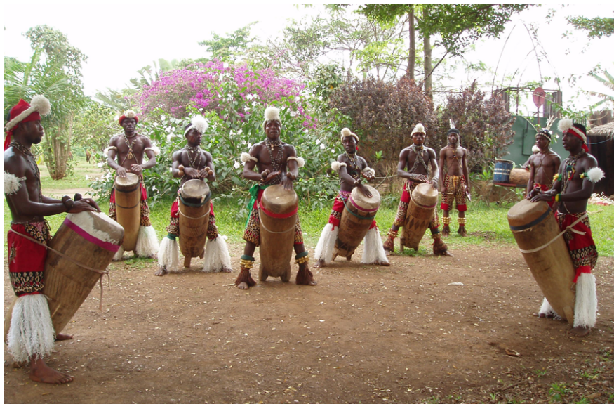
Congo ngoma ntela drums