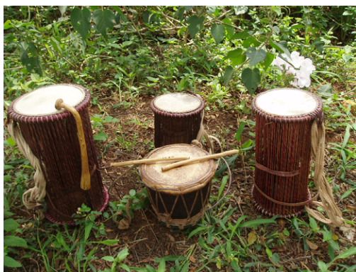
Cameroon kalangou drums