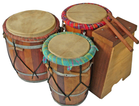
French Guiana Creole kasékò drums