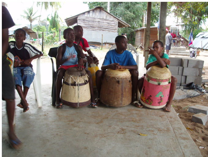
Bushinenge aluku traditional drums

From Sub-Saharan Africa to Americas, the drum as a “cultural being” for a “musical word”